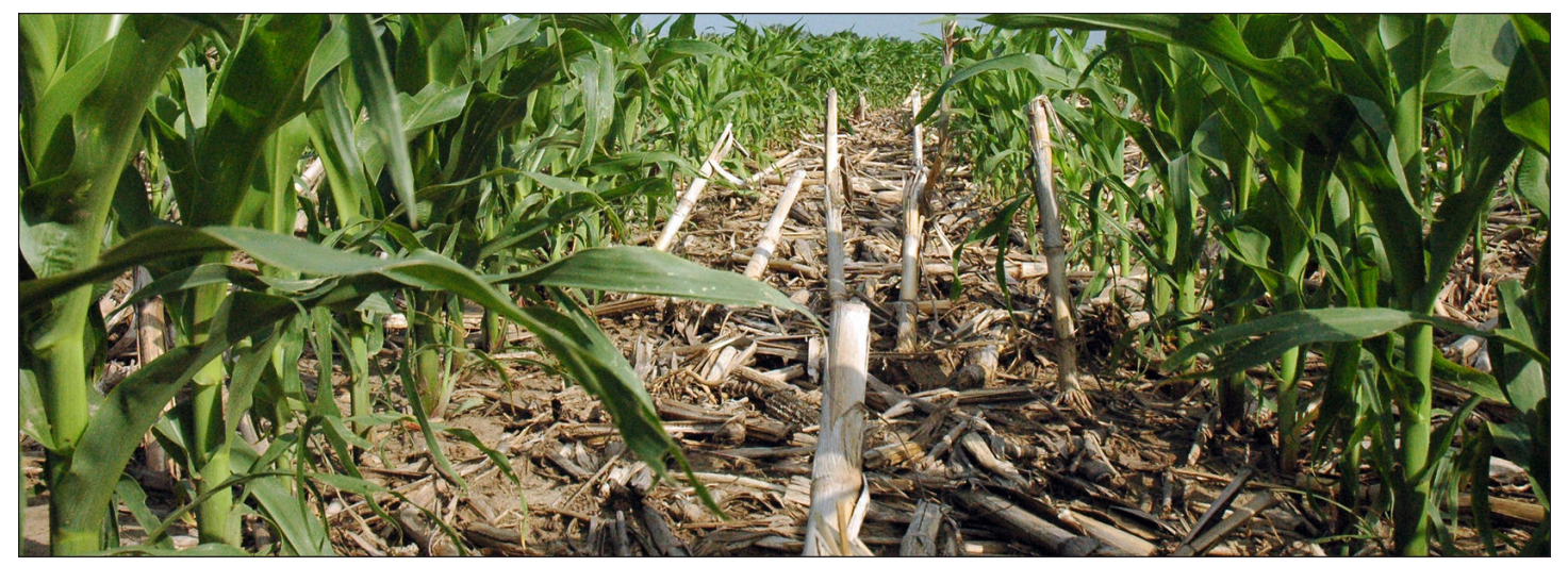
Corn planted into no-till corn residue.