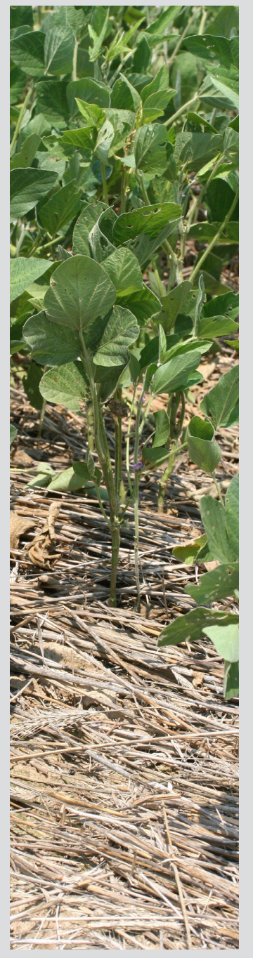
No-till soybeans in stubble.

The Soil Tillage Intensity Rating (STIR) was used to calculate the soil disturbance intensity for each crop grown in each of the previous 3 years of management at each sample point of the NRI-CEAP-Cropland farmer survey period (2013–16). STIR is a function of the kinds, frequency, and depths of tillage. Tillage management and conservation tillage adoption was assessed on a crop-by-crop basis for each cropping system. Management of each crop was classified according to the average annual STIR values for the implements used to produce the crop. For each implement used, fuel consumption was estimated assuming the same moisture conditions, recommended speed, and tractor horsepower. The fuel use in diesel equivalents was averaged for the rotation within each tillage classification. The fuel consumption requirements for each implement used were based on a standard developed by the Nebraska Tractor Test Laboratory (NTTL) and available at: tractortestlab.unl.edu/ nebraskatractortestlabpublications and through ASAE (ASAE Standards, 2002a, 2002b). Emission reductions from fuel savings are based on the U.S. Department of Energy (DOE) Energy Information Administration's estimate that a gallon of diesel fuel emits the equivalent of 22.4 pounds of CO<sub>2</sub> emissions (eia.gov/tools/faqs/faq.cfm?id=307&t=11).