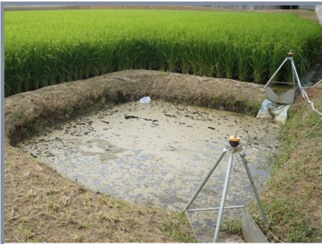
A representative field study monitoring the discharge of agricultural NPS